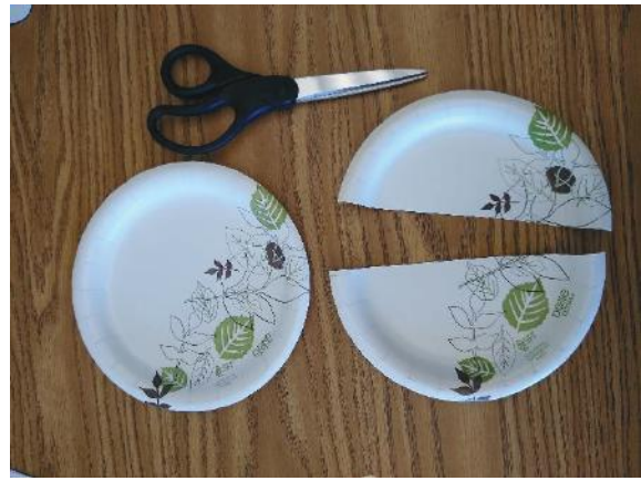
Step 2: Cut 1 paper plate in half