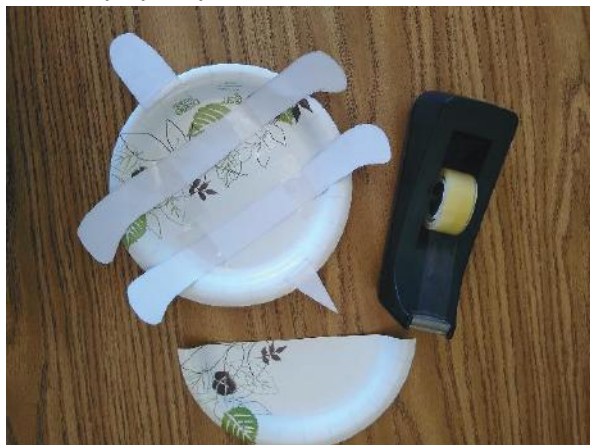
Step 3: Attach the head, legs, and tail to the paper plate