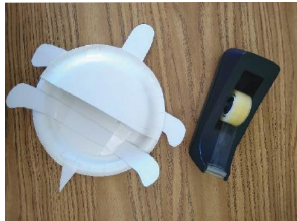
Step 4: Attach Half of the plate